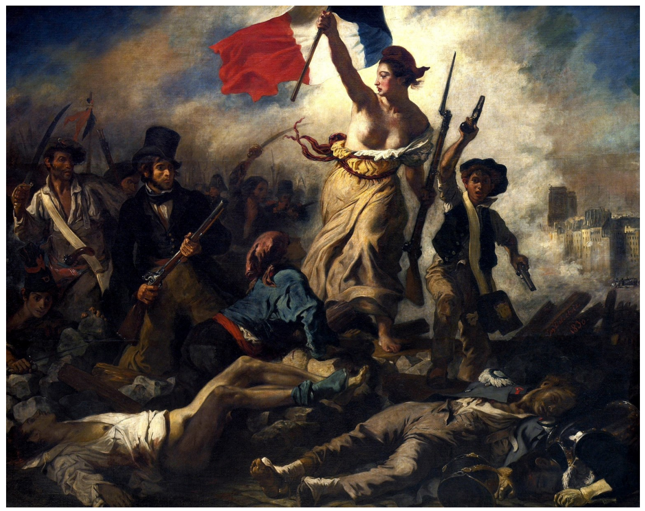
(French Romantic art, Liberty Leading the People, Delacroix, 1830)

Book text of this section available under the Creative Commons Attribution-ShareAlike License