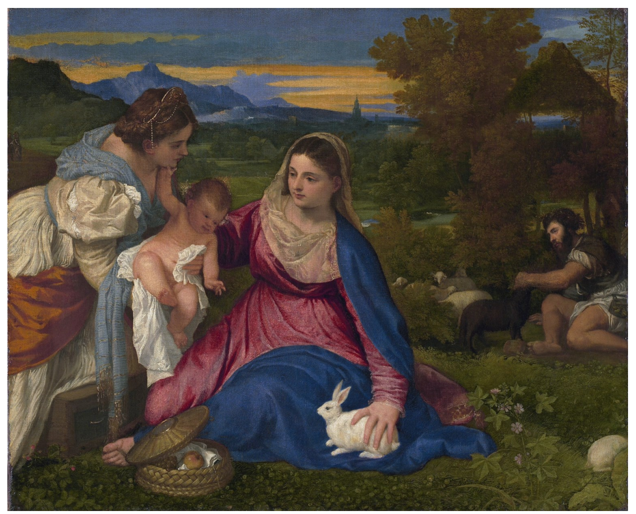
(Titian, La Vierge au Lapin à la Loupe (The Virgin of the Rabbit), 1530, Louvre, Paris. Idealized Italianate landscape background)